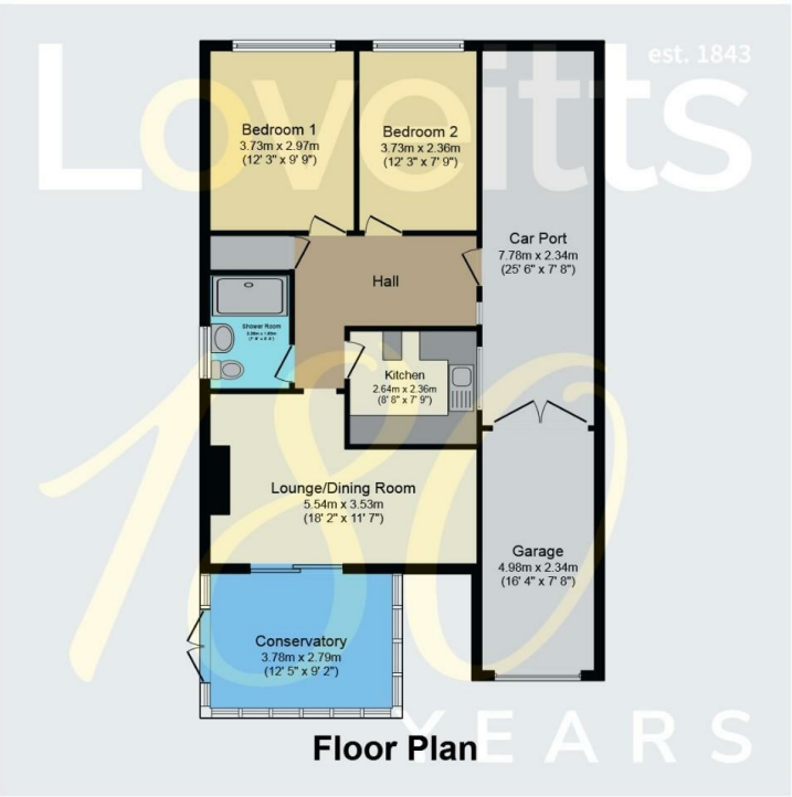
Total floor area 101.4 m 2 (1,091 sq.ft.) approx This plan is for illustration purposes only and may not be representative of the property. Plan not to scale. Powered by PropertyBox